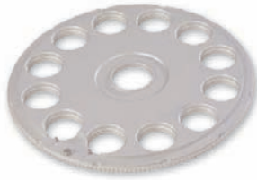
Precision machined, industrial strength aluminum lens dials