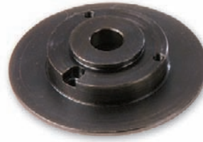
Heavy duty, precision bearing races